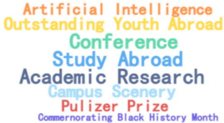
Figure 1: Top 20 Keywords of Popular Content of Each University